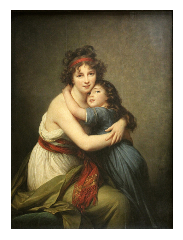
Figure 8: Elisabeth Louise Vigée Le Brun, Self-Portrait with Her Daughter Julie (à l'Antique),

1789, oil on wood, 130 x 94 cm (Musée du Louvre, Paris)