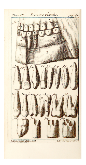
Fig. 4: Fauchard, Pierre. "Showing complete dentition in both jaws. Our part of the bone removed to show the roots. Various kinds of teeth and their sockets." The Surgeon Dentist ... translated from the second edition ... by Lilian Lindsay.with plates . 1946.