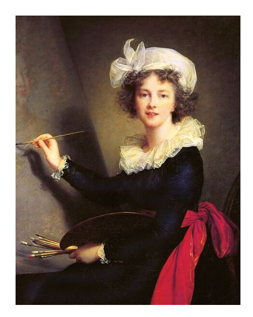
Fig. 6: Le Brun, Elisabeth Louise Vigée, Self-Portrait, Oil on canvas, 1790, French