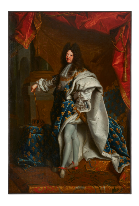
Fig. 1: Riguad, Hyacinthe, Portrait of Louis XIV, Oil on canvas, 1701, Musée du Louvre, Paris