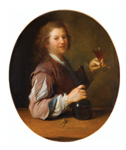
Fig. 3: Alexis Grimou, Portrait of the Artist as a Drinker, 1724, oil on canvas, 39 × 33 in. (100 × 85 cm). Musée du Louvre, Paris, INV5045 (artwork in the public domain; photograph by Franck Raux, © RMN–Grand Palais)