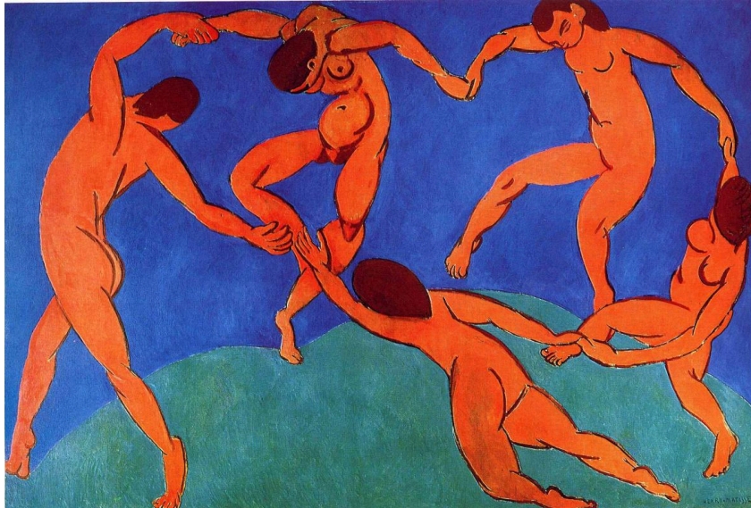
Illustration by Henri Matisse, Dance . 1910.

In his early work "Dance," Henri Matisse became involved with the flat perspective Art Historians now consider quintessential to the Fauvist movement. 185 In this piece, Matisse depicts five swirling nude dancers holding hands in a circle except for one small space, meant to invite the viewer in to join. 186 "Dance" received rageful and indignant reviews for its Fauvist color scheme (red, blue, and green), which, with minimal shading in the background, created the effect that the members of the dance were simply drawn on, offering little to no depth in the work, which was remarked by critics as too "simplified" for art. 187 Notable supporter of Matisse's work was the poet Apollinaire, who seemingly alone stood in Matisse's defense. 188 More notable was