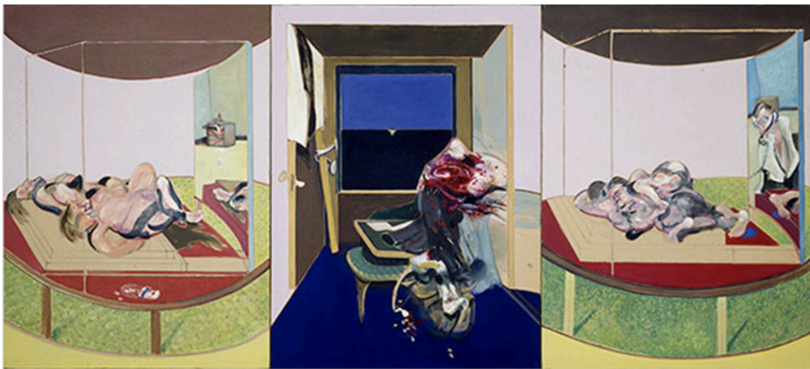
Illustration by Francis Bacon, Sweeney Agonistes , 1967

What could have caused this intellectual transition? To examine Eliot's later dramas it is necessary to unravel Eliot's experiment, "Sweeney Agonistes," and why it was left a fragment. In this essay, I argue that Eliot's struggle with completing "Sweeney Agonistes" and his abandonment of his character, Sweeney, represents his toil with combining modernist themes and form with his desire for tradition.