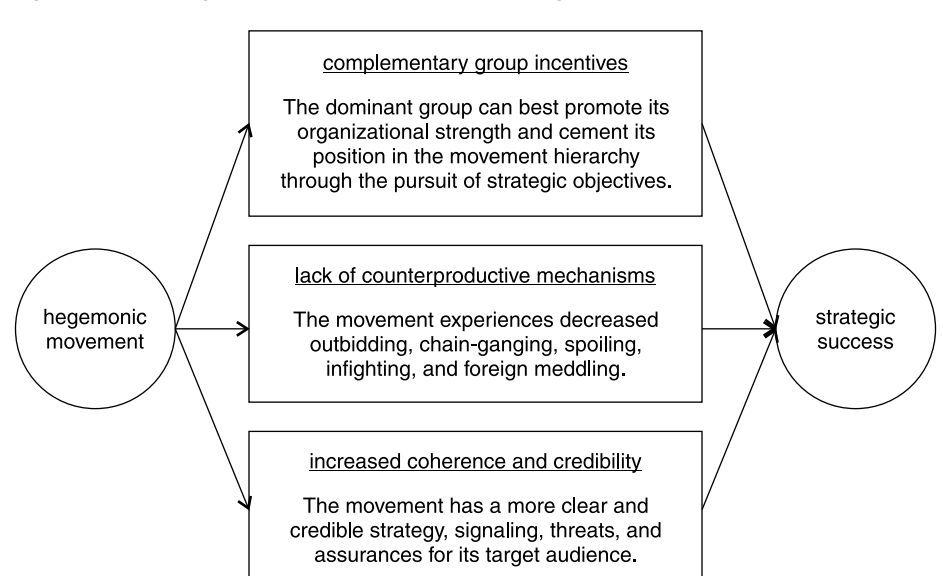
Figure 2. How Hegemonic Movements Cause Strategic Success

type), <sup>19</sup> how one employs that power to achieve the desired goal (strategy), <sup>20</sup> and how clear and credible one is in making threats to employ violence and assurances to stop it (credibility and signaling).<sup>21</sup> Power distribution theory holds that many of the factors identified in these works—strategy, credibility, and signaling—are driven by movement structure, and they serve as intervening variables in the theory's causal mechanisms. Nonetheless, theories that treat movements as unitary suggest no variation in strategic success across campaigns as movement system structure changes, ceteris paribus.