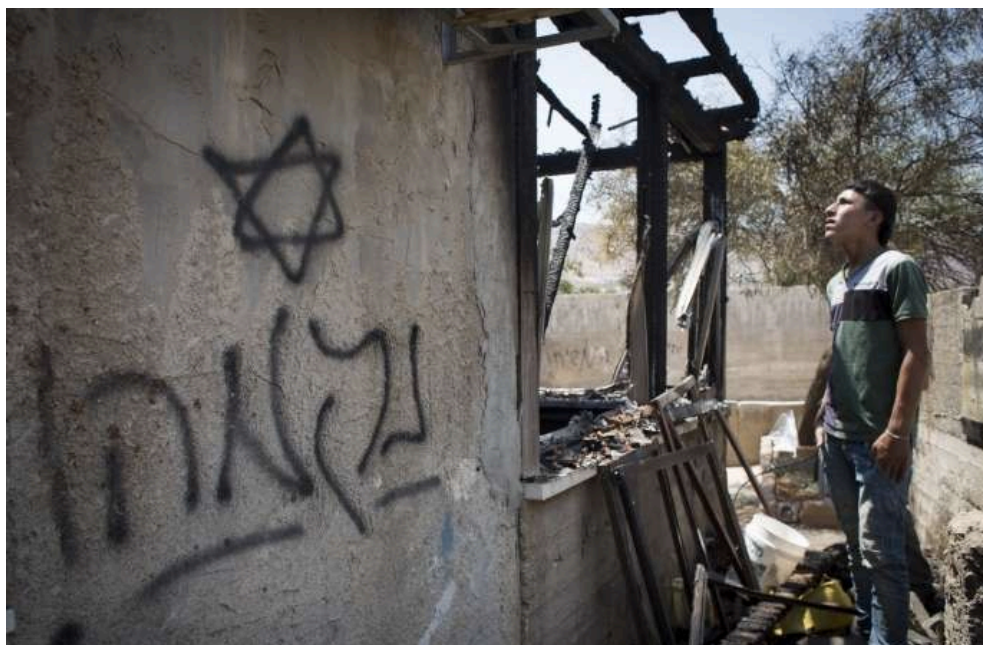
Figure 2. “Revenge!” Graffiti on the Burned House in Duma

Most of the perpetrators of price-tag hail from the “hilltop youth.” This is blanket term that covers a number of groups of West Bank settlers that share common geographical, demographic, and ideological attributes. First, hilltop youth generally reside in unauthorized outposts—settlements that were created without the formal consent of the Israeli government, generally within the past decade or so. As such, they help bypass international pressure on Israel (and subsequently from the government itself) to halt the construction of new settlements. The outposts do not come in one flavor: some are distant neighborhoods of existing settlements and replicate their communal, middle-class life style, such as Mitzpe Dani, Ma’ale Shlomo, and Yeshuv Ha’daat. These outposts enjoy some support from the mainstream national-religious settlers and some state agencies. 27 Other outposts are located further away from existing settlements, may include only 1-3 families, and were created in order to allow their inhabitants an alternative lifestyle, usually one that has new-age, back-to-nature elements, such as Skali’s Farm, Mul Nevo, and Ma’ale Oren. 28