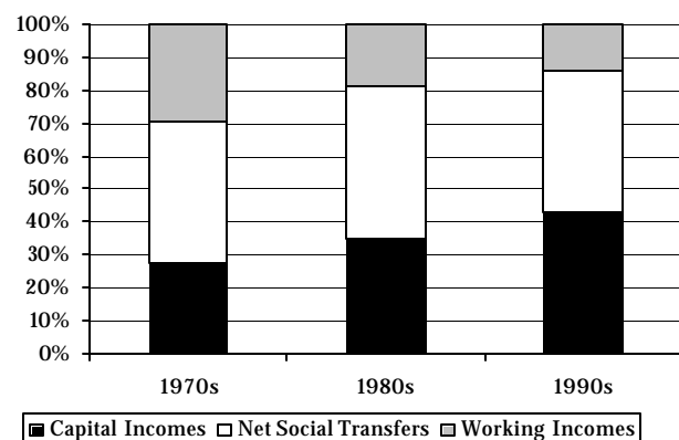
Figure 2. UK Disposable Income by Source, Age 65 and Over

The economic position of the elderly clearly improved over the last two decades of the twentieth century. Average incomes rose from 50 to 60 percent of average earnings as employer pensions and investment income expanded to provide 43 percent of old age income, up from 27 percent two decades earlier (see Figure 2). Nor were the elderly any longer a distinctly poor population. They were half the lowest income quintile in 1979, but less than a quarter in 2000. Nevertheless, the income gains were concentrated at the upper end of the income distribution, among those with pensions and capital