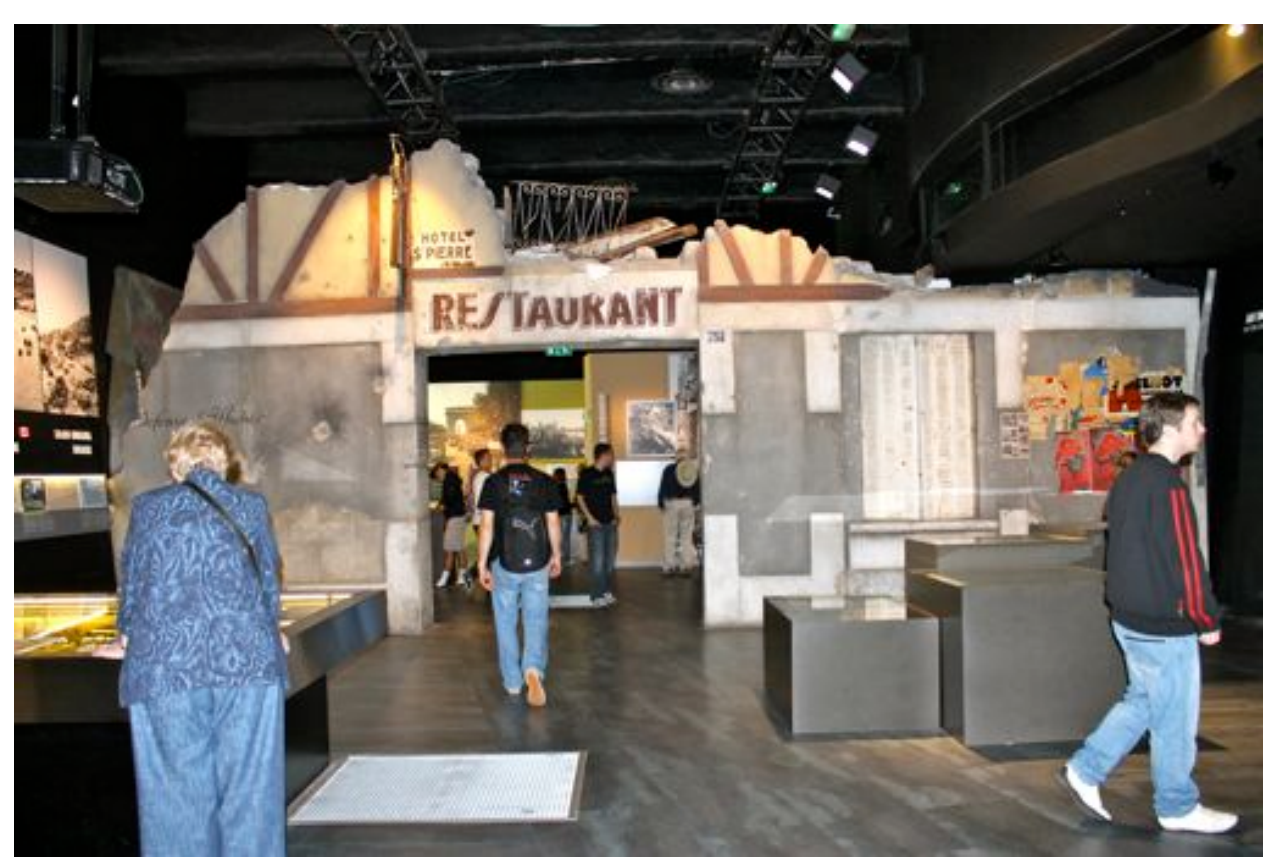
Figure 1.6: The first of the three rooms of the D-Day exhibit (and an example of the artificial reconstruction of the destroyed infrastructure of Caen).

of the landing. The rooms are listed in this order because it is this path that the visitor is encouraged to take, entering from first of these three and exiting from the last room out into the main museum lobby. The only separation between these rooms is an artificial wall structure composed to look like the ruins of occupied Norman towns bombed by the Allies during the invasion (see Figure 1.6). In fact, besides the logistical and historical information surrounding the D-Day operation, this exhibit also includes a great deal of information about the suffering of the people of Normandy, as will be seen in later chapters when this exhibit's translated texts are analyzed.