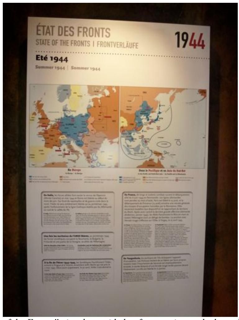
Figure 1.4: "State of the Fronts" visual, provided at frequent intervals throughout the Avant 1945 half of the museum.

At the end of the Avant 1945 section, a visitor begins to apprehend a dramatic shift in the tone of the exhibit. The oppressive dimness and enclosed, twisting spaces of the rooms devoted to the previous topics begin to release, and natural sunlight creeps into the walls of the final part of the walk through the Avant 1945 period of world history. Suddenly, at the end of yet another low-ceilinged, bunker-like stone room, one sees an opening filled with light and, significantly, with a staircase that takes us to the source of this light (see Figure 1.5). This staircase takes us back to the ground floor of the museum, where natural lighting and open spacing provides a welcome contrast to the previous hours spent in bunkers that explore what is certainly framed as