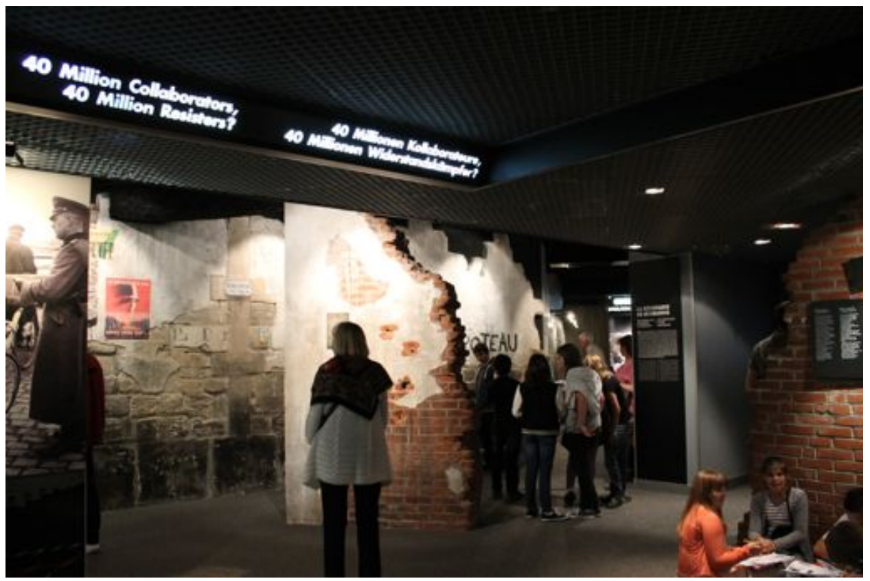
Figure 1.3: A portion of the exhibit devoted to the Résistance (both walls and text discussed).

Another tool used to narrativize World War II and to create a "path" through it is a series of maps that present Hitler's advancing progress in his conquest of Europe. As arrows guide a visitor between various open spaces that explore the different topics of the exhibit, maps provide visual checkpoints that ground him or her within the chronology of the war (see Figure 1.4). Each is titled États des fronts or "State of the Fronts" and uses color shading to show the physical progress of both Hitler's efforts to conquer Europe and the Allies' efforts to defend against him. This organized visual representation of the events of World War II serves to further reinforce the narrative quality of the exhibit.