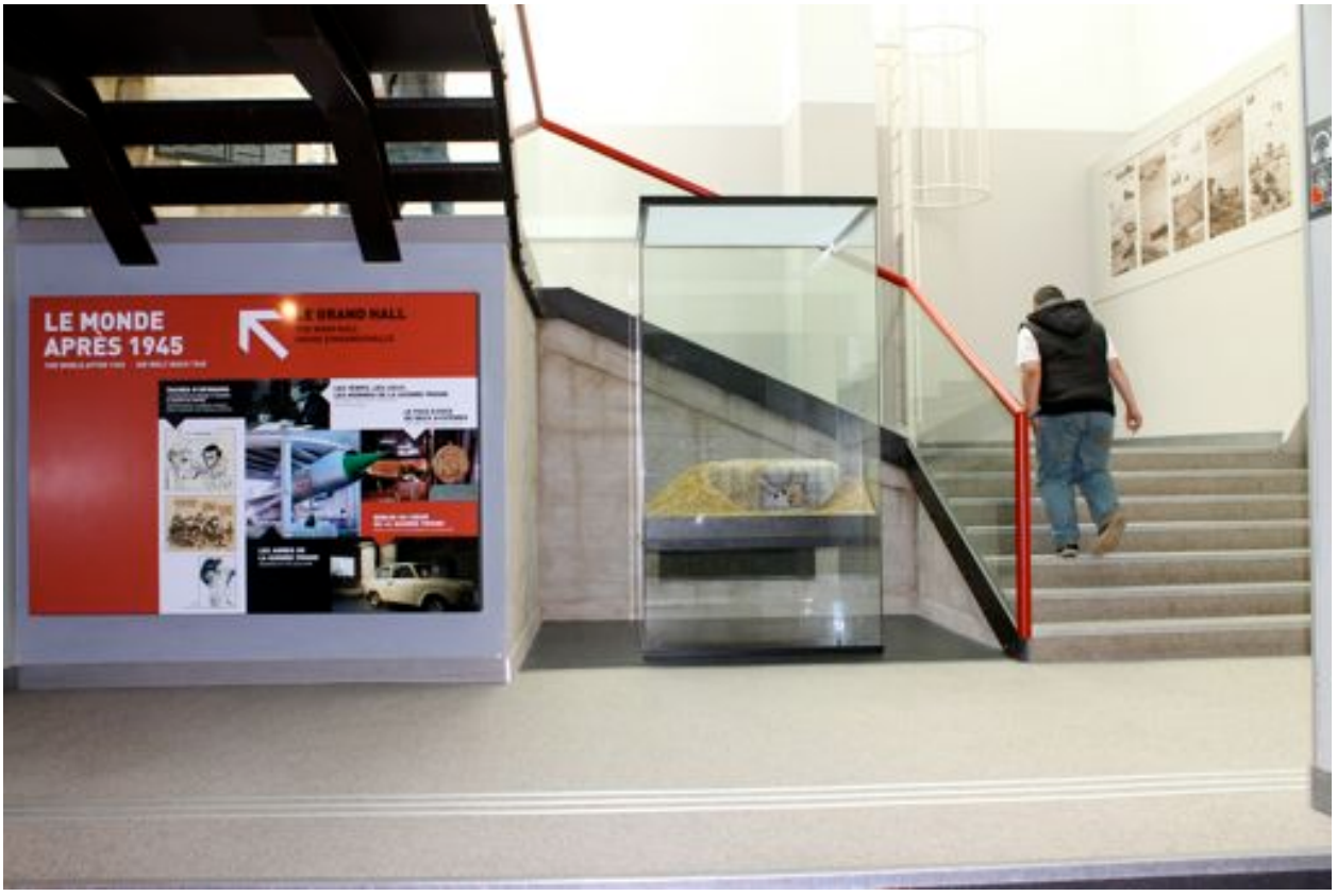
Figure 1.5: The spacious opening that signals the end of the Avant 1945 exhibit and leads the reader up, into the light, toward the D-Day and the Après 1945 exhibits.

a dark period of world and European history. This change to a light, open, physically liberated space is immediately followed by the presentation of the chain of rooms that constitute the D-Day exhibit. This exhibit, placed at the end of the pre-1945 exhibit, surrounded by light, and signaling a new post-1945 era, is thus framed by the path of the museum to present the invasion as both catalyst and liberator in the World War II narrative.