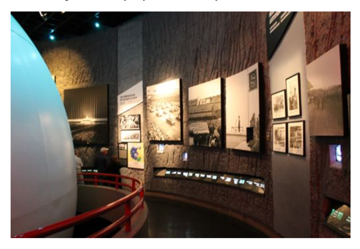
Figure 1.1: The descending spiral ramp "into" the beginning of World War II.

By choreographing the physical descent of the visitor down into the events of World War II, the museum implicates the position of World War II as a low point in the larger historical narrative. The timeline offers an even more explicitly linear presentation of historical events, thus reinforcing the narrative quality of the museum's presentation of World War II.