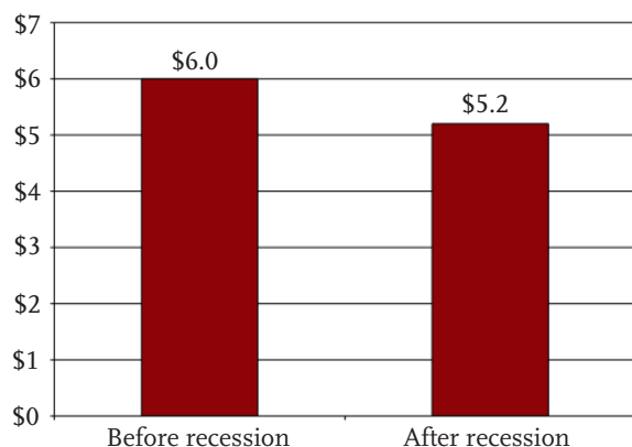
FIGURE 3. ESTIMATES OF PROSPECTIVE INHERITANCE RECEIPTS FOR BABY BOOMERS BEFORE AND AFTER THE RECESSION, TRILLIONS OF 2009 DOLLARS

It is important to stress that most boomers have not yet received any inheritance. And the amount and timing of inheritance receipts is highly uncertain. Even parents who have a strong desire to leave a bequest may be forced to revise their plans based on fluctuations in the value of their assets. Or they may exhaust their wealth as a result of medical and, especially, long-term care costs. In short, an anticipated inheritance may not materialize. Even when inheritances do occur, recipients generally get the money when they are older and the amounts are typically not large enough to be life-changing. Therefore, boomer households need to make many of their key financial decisions before they ever receive any inheritance. And they should not count on an inheritance to eliminate the need for increased retirement saving. 21