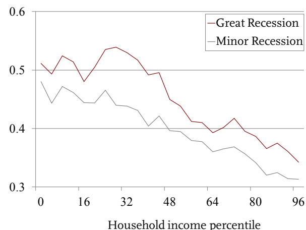
FIGURE 3. PREDICTED PROBABILITY OF CLAIMING AT AGE 62 BY HOUSEHOLD INCOME, GREAT RECESSION VS. MINOR RECESSION

The results of this exercise suggest that, compared to a mild recession, the Great Recession would have produced a 5.6-percentage-point increase in the number of early claimers, as represented by the average difference in the red and gray lines in Figure 3. Strikingly, the impact of the unemployment rate on the probability of claiming at age 62 is relatively uni-