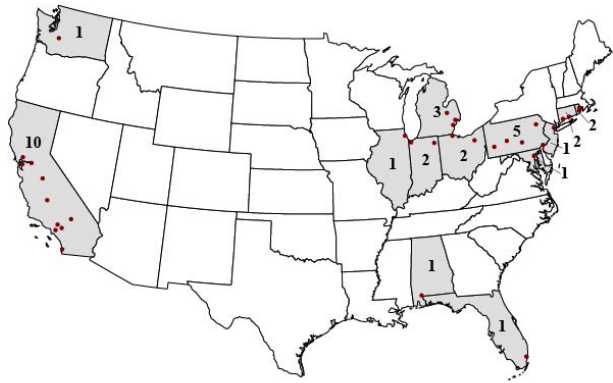
FIGURE 1. LOCATION OF PLANS CITED IN THE PRESS AS HAVING FINANCIAL PROBLEMS

The map in Figure 1 shows that almost one third of the troubled localities are located in California.