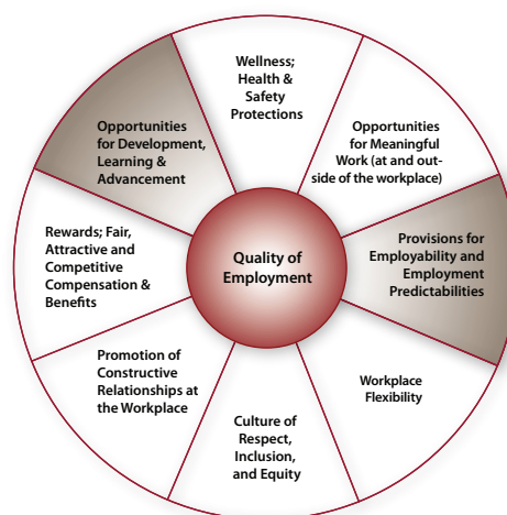
Figure 2B. Quality of Employment: Practice