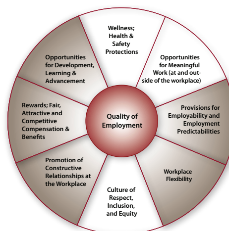
Figure 2A. Quality of Employment: Strategy

changing workforce, Central Baptist has begun to stratify any data they gather within the organization based on age.