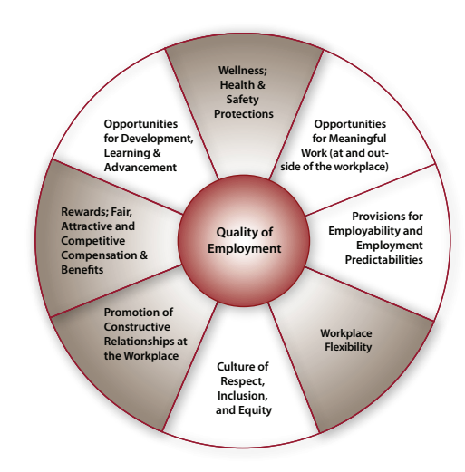
Figure 1A. Quality of Employment: Strategy

In addition to business demands and customer needs, Fidelity would like to address the desire for flexibility throughout the organization, particularly in Retirement Services. Flexibility not only meets employees' needs, but it accommodates the nature of the business. The goal is to develop a staffing model across their phone organization that is more flexible and adaptable to the times of day, week, and year that the demand for Fidelity's services is at its greatest.