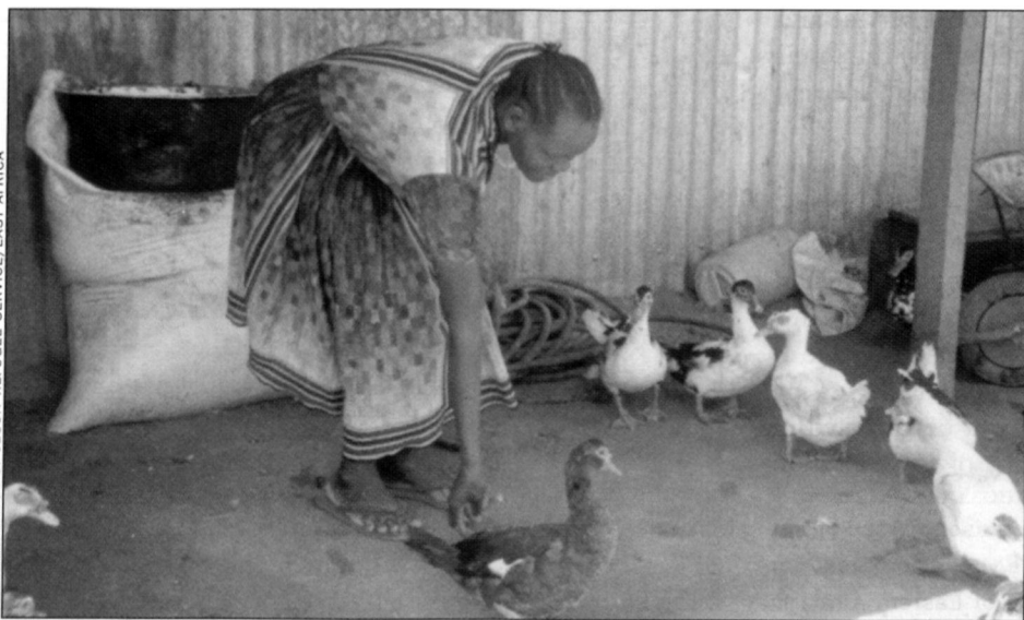
A refugee woman feeds ducks as part of the J.R.S. poultry project in Kakuma.

The dedication to peace by refugees from all sides of the conflicts represented in the camp shows that peace is achievable if the relevant actors can find the will and creativity to bring it about. Kakuma is a microcosm of nearly all the conflicts that so