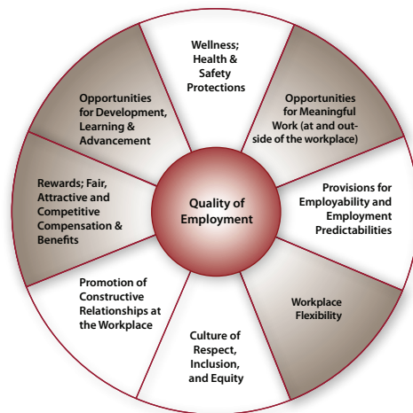
Figure 2A. Quality of Employment: Strategy

With the baby boomer generation beginning to become retirement eligible, there is growing pressure to find their replacements. (See Figure 3 for details.) However, Wachovia recognizes that to maintain their position as an employer-of-choice, they must adjust their strategies to both attract and retain this new multi generational workforce. Simply staying "on course" and relying on existing early career hiring strategies may no longer be sufficient.