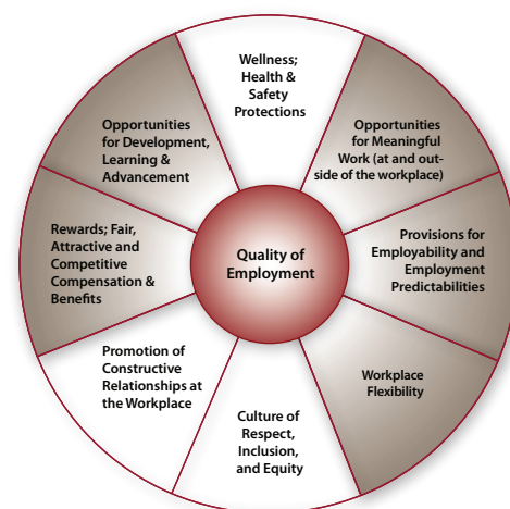
Figure 2B. Quality of Employment: Practice

Wachovia would like to leverage their alumni for other initiatives as well, such as holding focus groups as a source